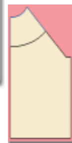
Setup for yoke design for knitters.