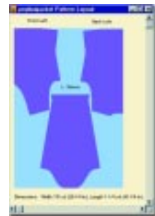
Pattern layout to determine yardage.