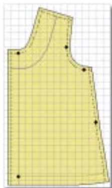
Final pattern mode.