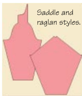
Saddle and raglan styles.

Cochénille Design Studio P.O. Box 234276, Encinitas, CA 92023-4276 USA (858)-259-1698 phone (858) 259-3746 fax www.cochénille.com info@cochenille.com